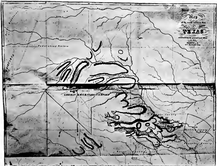
SITUATION OF THE GRANT IN 1846