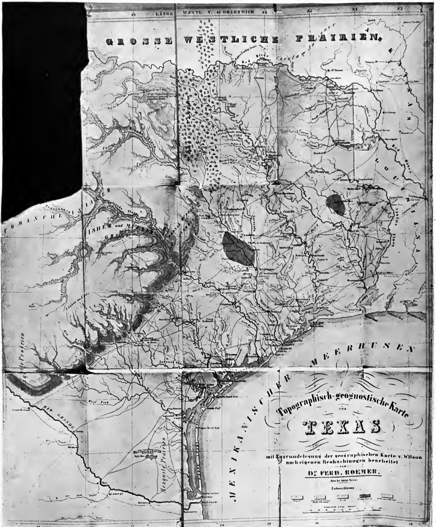
TEXAS IN 1848, SHOWING THE GERMAN SETTLEMENTS.