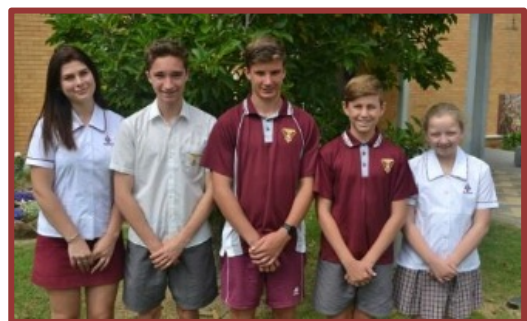
Left to Right - Boys and girls senior uniform, girls and boys junior and sports uniform

We sell one style of hat through the uniform shop. Alternatively students may wear a brimmed hat of their choice in the colours - grey, maroon, black or white. We encourage all students to take responsibility for their own skin protection.